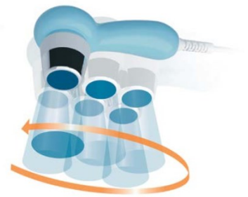
Hand operated application by a therapist