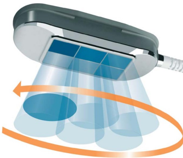
Automatic application by the HandsFree Sono™

2.14. The BTL HandsFree Sono™ brings the unique Rotary Field Technology. It is the first ultrasound applicator on the market which creates electronically precise rotating ultrasound field without necessity of a therapist activity. This outstanding technology enables very fast, effective and comfortable treatment and reduces operator fatigue.